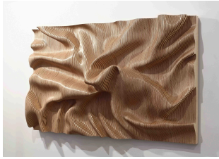
Expose Exposed 131201, 2013 White Birch Wood, 60 x 183 x 22cm