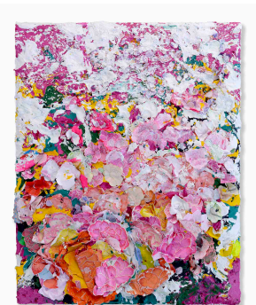
Summer Flower, 2015 Rice paper & acrylic on canvas 150 x 120cm

they are the 'nodes' of various things – personal, popularity and even power, all of which are manifested in every human subject. Amidst our glorification and idolatry of the sought-after crowd, it is easy to forget that it is the power of our favour that holds them aloft, Rachman leads us to the realisation of the diverse distribution of power between and amongst people from all factions of society.