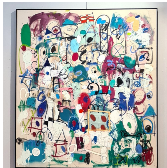
A Sliced Bread - mixed media on canvas 200 x 180cm