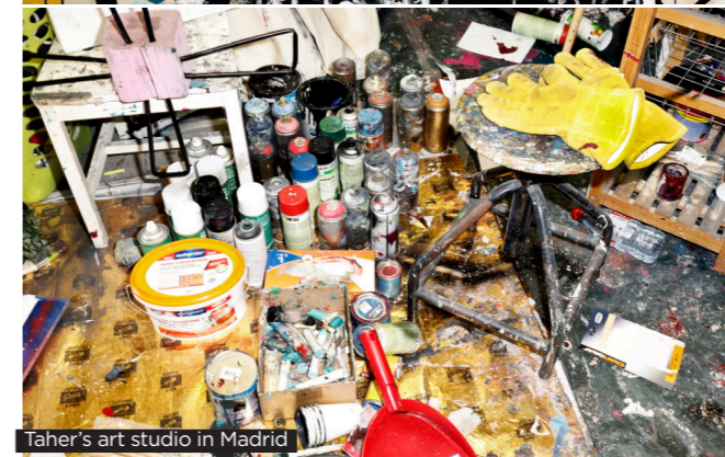
Taher's art studio in Madrid