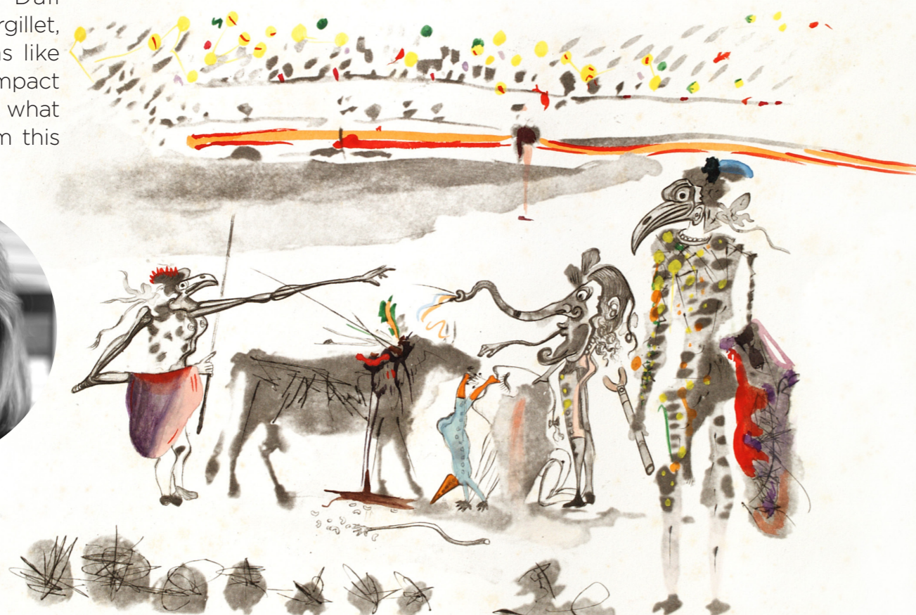
"Bullfight with Parrots" from the Surrealist Bullfight series

In his daily life, Dali was a workaholic, very much immersed in his projects with my father. When he wasn't busy with his paintings, he spoke with many people from all works of life – from discussions about DNA research with scientists to talks with bankers about preparing the longest baguette in the world to be carried along the streets of Paris. Often, these people would come together to mingle at his hotel. However, he still found time to meet us and we always had a fun time.